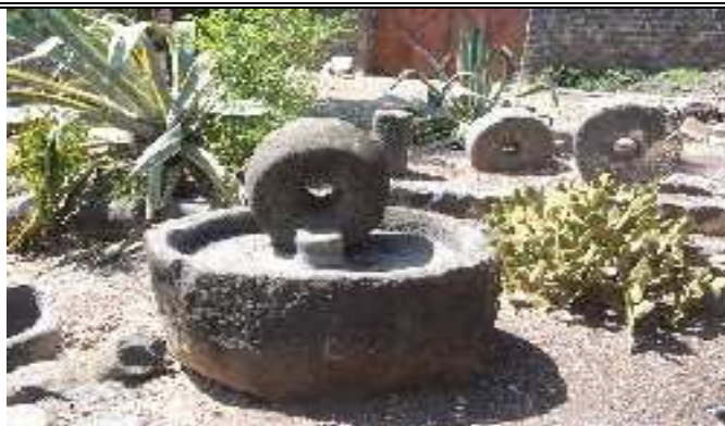
Millstone found in Capernaum